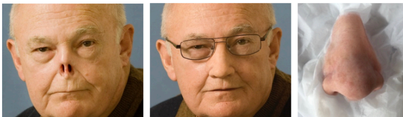
Nasal prosthesis that attaches with skin adhesive.

We create a nasal prosthesis to restore normal contour and improve function for patients who have experienced partial or total loss of their nose to traumatic injury, disease or due to surgical removal of the nose ( rhinectomy ). We artistically recreate a shape that closely resembles the form of your nose before surgery based on our knowledge of craniofacial anatomy, artistic expertise and photographs that you supply.